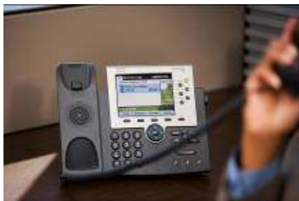
Figure 3. Cisco Has Deployed More than 23 Million IP Phones

The portfolio includes both wired and wireless LAN solutions, software-based communication applications for PCs and mobile phones, and solutions for conference rooms and expansion modules for selected phone models, delivering added scalability.