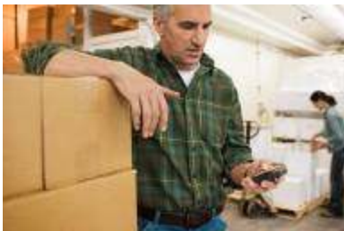
Figure 1. People Still Play "Phone Tag" when Communications Applications Are Not Integrated

This communications complexity illustrates why organizations worldwide now consider unified communications one of the top two strategic technologies (source: Gartner's Top Ten Strategic Technologies for 2008).