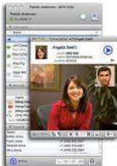
Figure 5. Cisco Unified Personal Communicator Makes It Possible to Reach Colleagues on the First Try

applications and web browsers. Visual Voicemail enables you to view, listen, and respond to Cisco Unity® and Cisco Unity Connection voicemail messages right from the Cisco Unified IP Phone display, without having to dial into your corporate voicemail box.