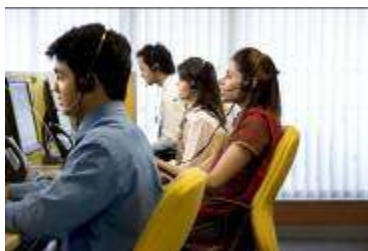
Figure 7. Cisco Contact Center Software Helps Enhance Customer Service

where they are located in the enterprise. Presence-enabled routing can dramatically improve first-call resolution and reduce response times.