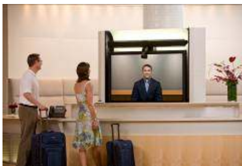
Figure 6. Cisco TelePresence Expert on Demand Delivers Virtual Customer Service and Point-of-Sale Services]