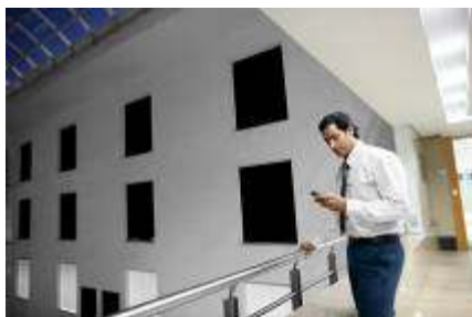
Figure 2. More than 85 Percent of the Fortune 500 Companies Use Cisco Unified Communications